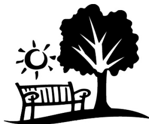
Worship in the Park